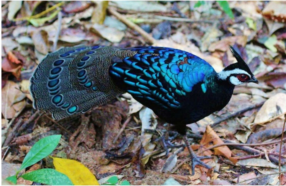
A male Palawan Peacock-Pheasant

March 24-25, Days 1-2: Departure from Home; Arrival in Manila. Most flights connecting from North America will arrive at Manila's Ninoy Aquino International Airport (airport code MNL) one or two days following your departure due to flight time and crossing the International Date Line. You will be met upon arrival by a representative of our ground agent and escorted to our hotel. We recommend flying in a day early due to potential misconnects and weather-related flight delays. Upon request, the VENT office will be happy to assist with any additional lodging arrangements. The group will assemble at 7:00 p.m. on the evening of March 25.